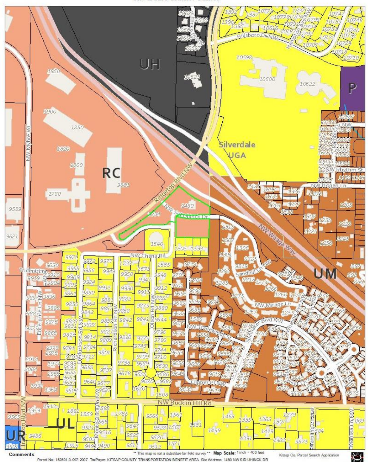
Silverdale Transit Center